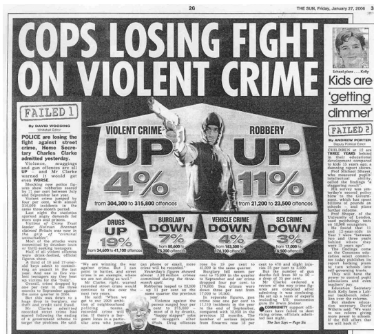
Figure 2.2 Cops Losing Fight on Violent Crime, Sun, page 33, 27th Jan, 2006