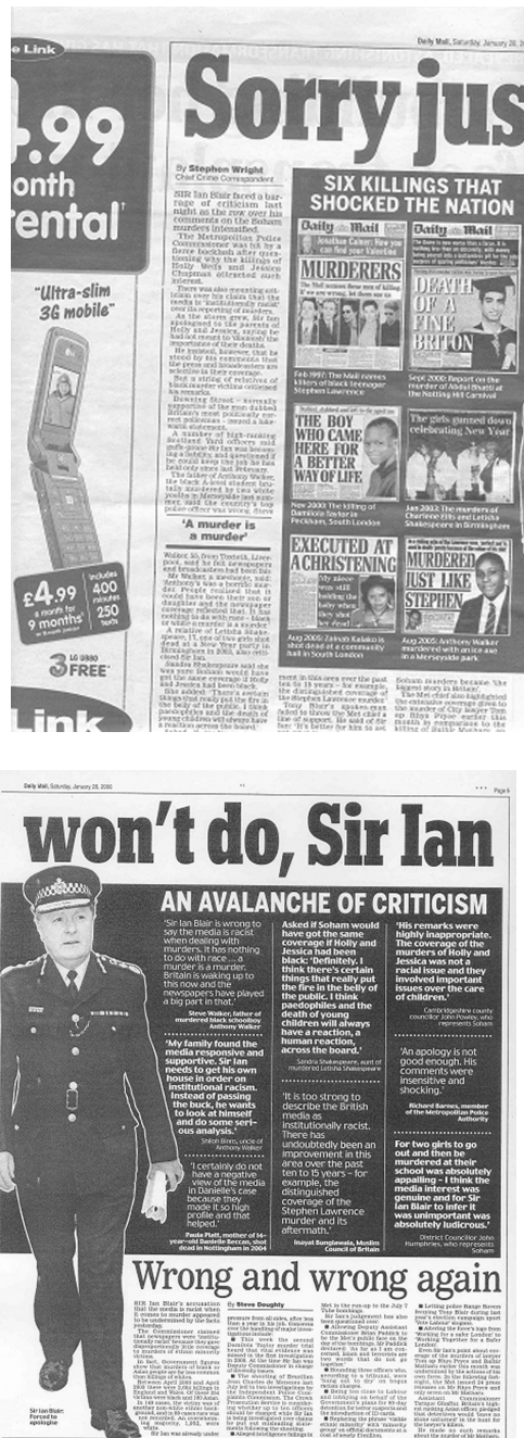
Figure 2.1 Daily Mail front page, Feb 1997 original, Permission received and images ready to go